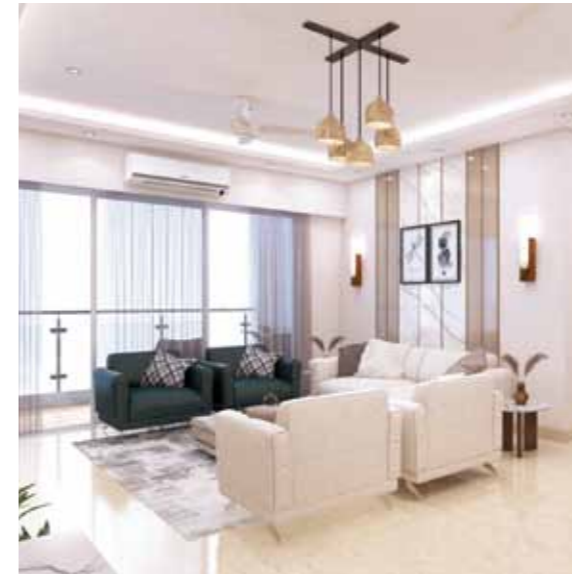
Enhanced floor-to-floor height up to 3.2 meters