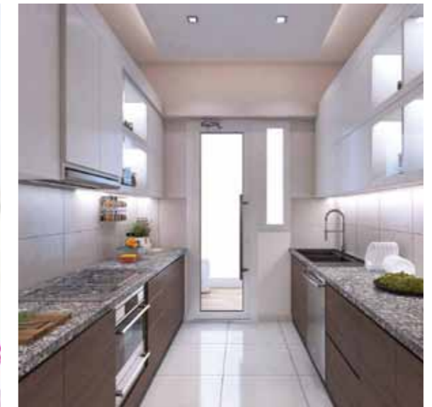
Fully fitted modular kitchen with appliances**