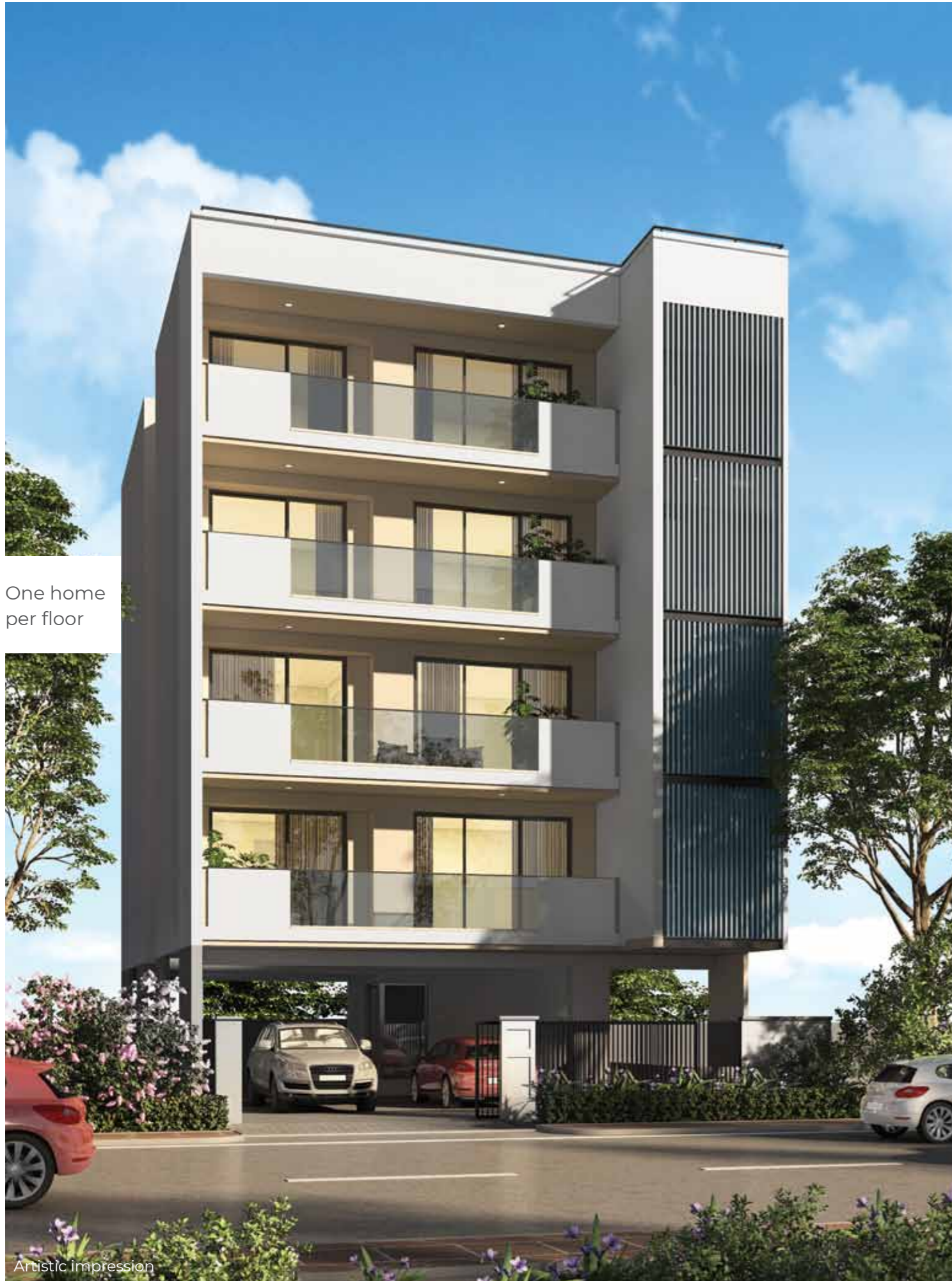
One home per floor