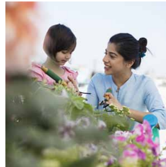
Exquisite terrace garden