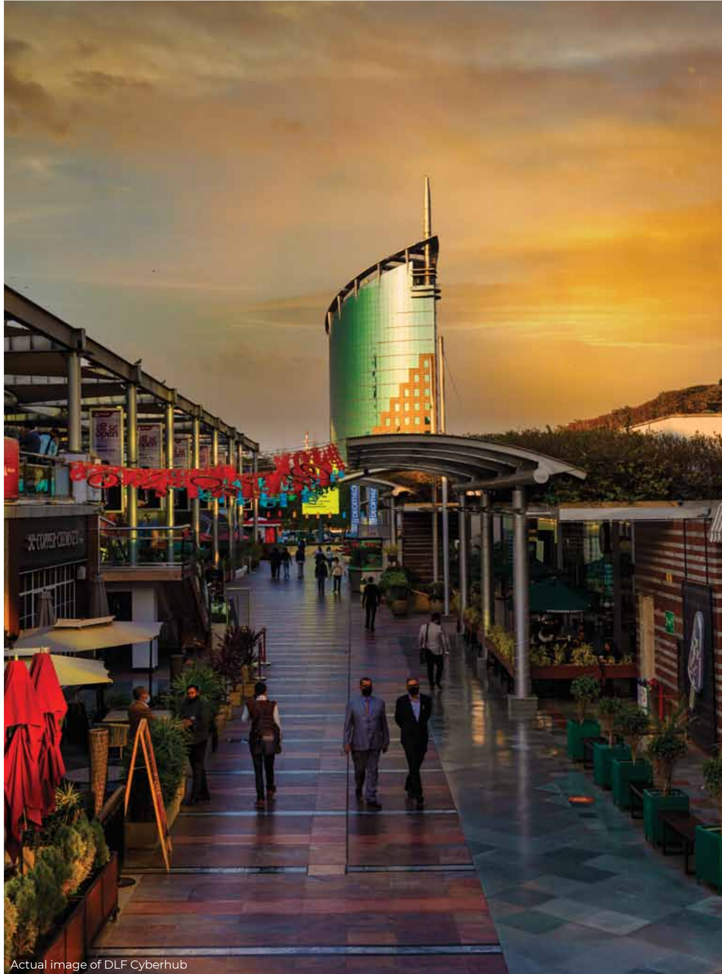
Actual image of DLF Cyberhub