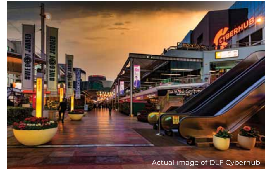
Actual image of DLF Cyberhub