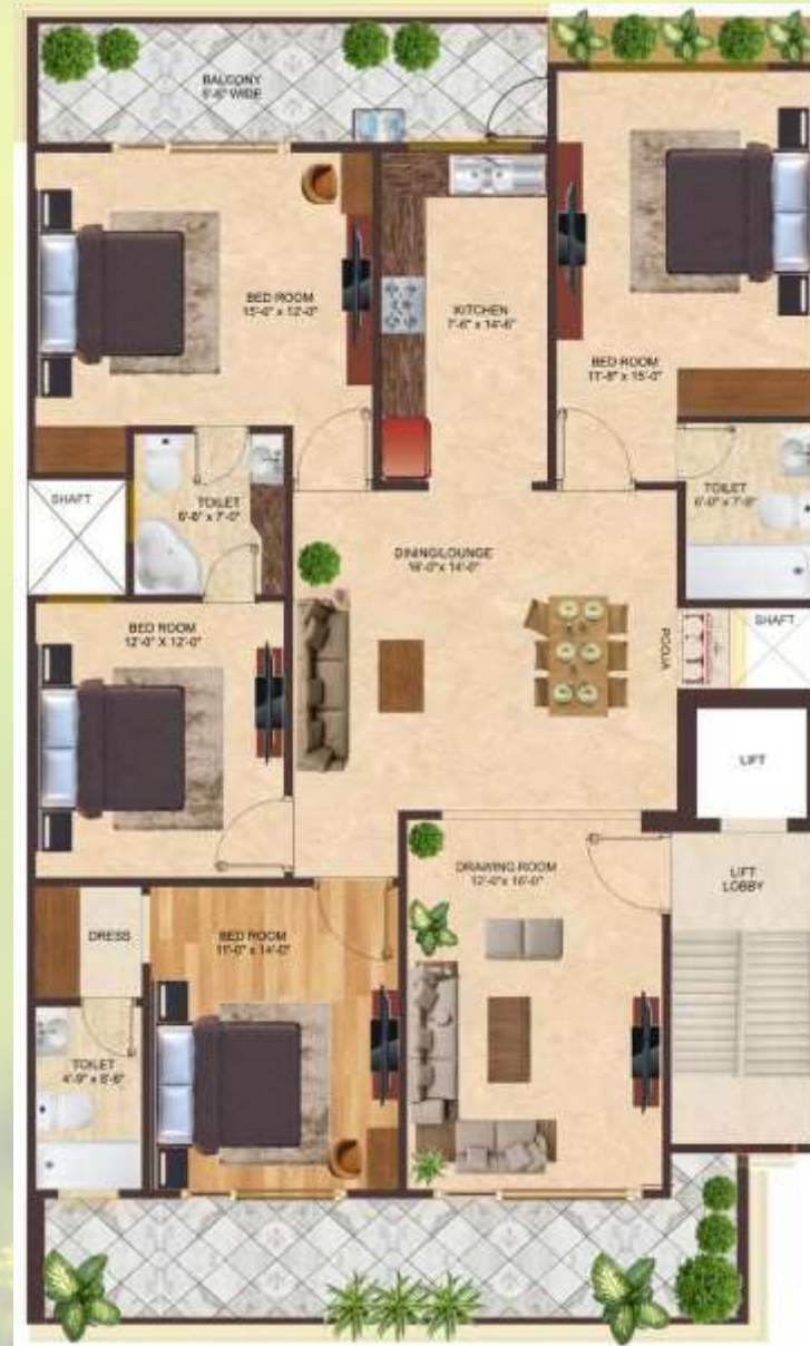
FLOOR PLAN LAYOUT