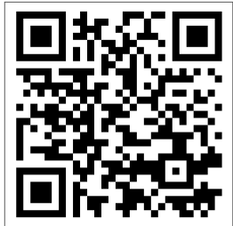
Google Map Direction