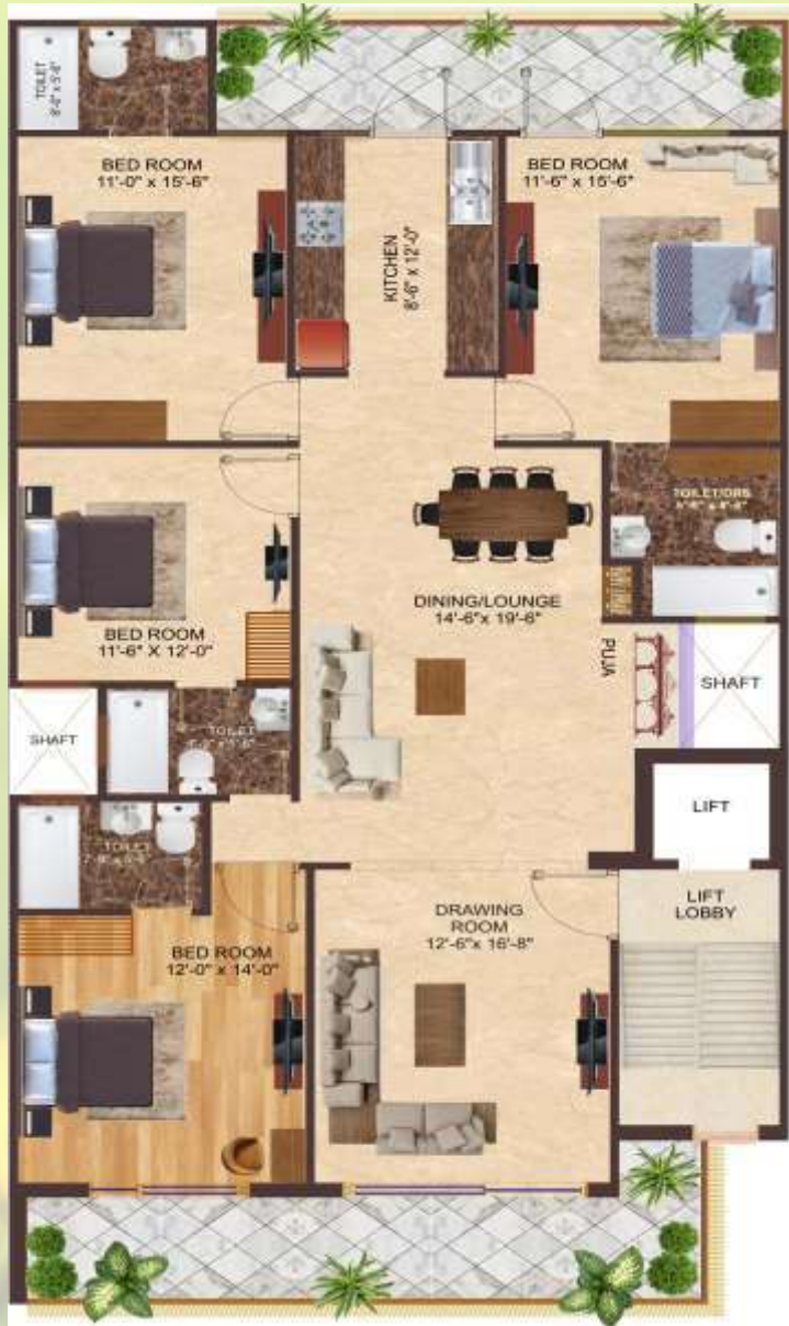
FLOOR PLAN LAYOUT