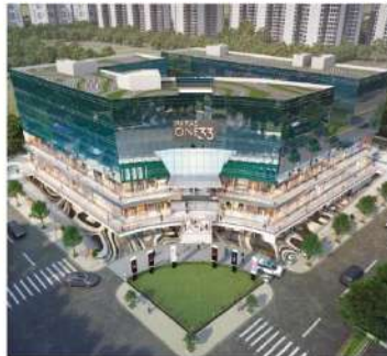
PARAS ONE33 On going