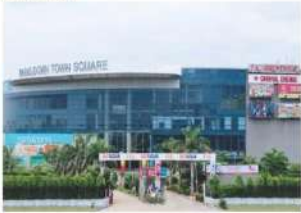
PARAS DOWNTOWN SQUARE Delivered