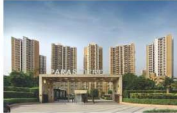
PARAS TIEREA Delivered