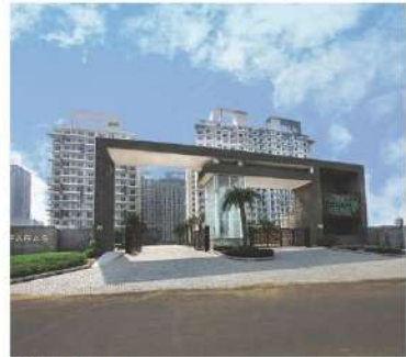
PARAS IRENE Delivered