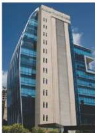
PARAS TWIN TOWERS Delivered