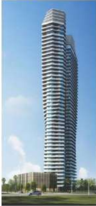
PARAS QUARTIER On going