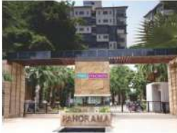
PARAS PANORAMA Delivered