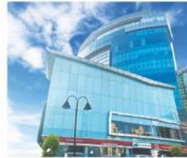
PARAS DOWNTOWN CENTER Delivered