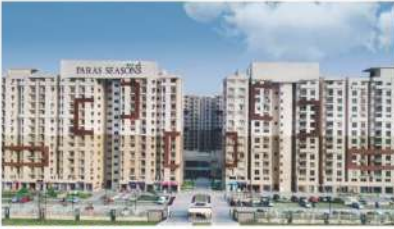
PARAS SEASONS Delivered